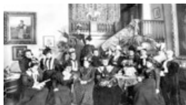
Bright, Dying Star: The American WASP