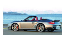
Perfect Porsche: 911 Turbo Cabriolet