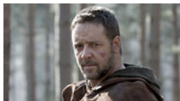
'Robin Hood': Why So Serious?