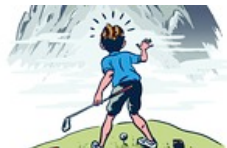
Golf's Big Problem: No Kids