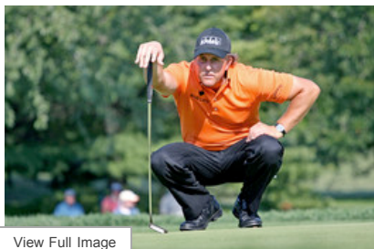
View Full Image

Phil Mickelson, the No. 2-ranked golfer in the world behind you-know-who (and comfortably ahead of No. 3, Steve Stricker), has always been most famous for his short game. Invariably it's described as "creative" or "imaginative" for the way he makes chips and short pitches dance, spin, check or roll out as circumstances warrant—and sometimes even when circumstances don't warrant. Once at the AT&T Pebble Beach National Pro-Am, when his ball lay on a downslope above a bunker, he turned to face away from the green and hit the shot backward, over his shoulder, onto the putting surface.